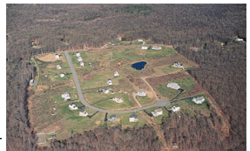
How forest fragmentation starts...

Forests prevent erosion, by slowing down rain water runoff. This also helps prevent flooding. Water quality benefits